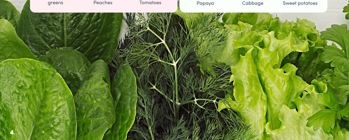
Cantaloupe Manaoes Watermelon