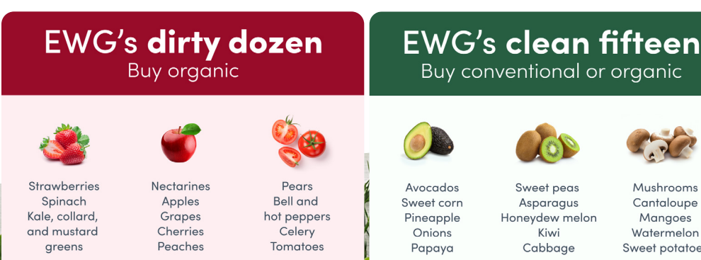
Buy conventional or organic

Each year, the Environmental Working Group (EWG) puts out a list of foods with the highest and lowest pesticide residues. When shopping for fruits and vegetables, be particularly mindful of the foods deemed in the "dirty dozen" category as these have the highest rates of pesticide and herbicide exposure. Meanwhile, those on the "clean fifteen" list have the lowest concentration of pesticide exposure, making them safer to eat if non-organic compared to other produce.